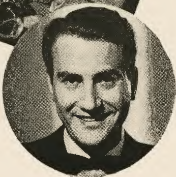
ARTIE SHAW (Right)