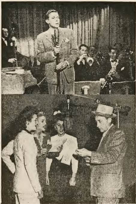
DICK HAYMES (Top) — BING CROSBY AND THE ANDREWS SISTERS