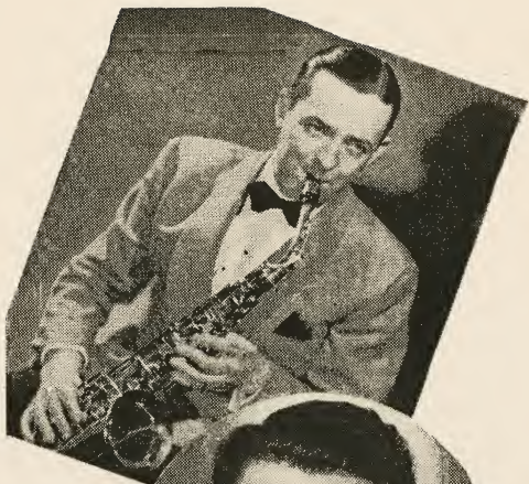
JIMMY DORSEY (Above)