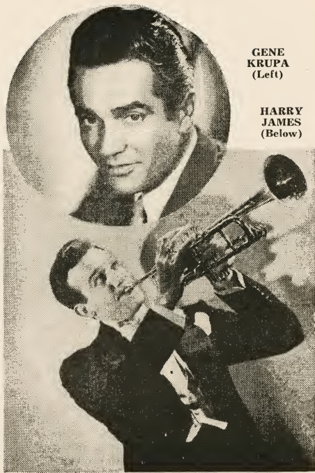
HARRY JAMES (Below)