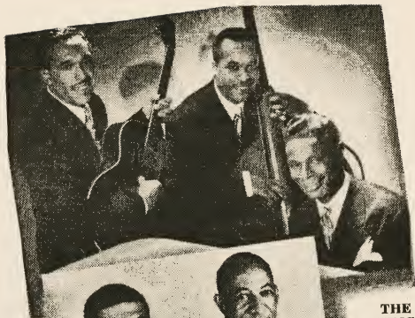
THE KING COLE TRIO (Above)